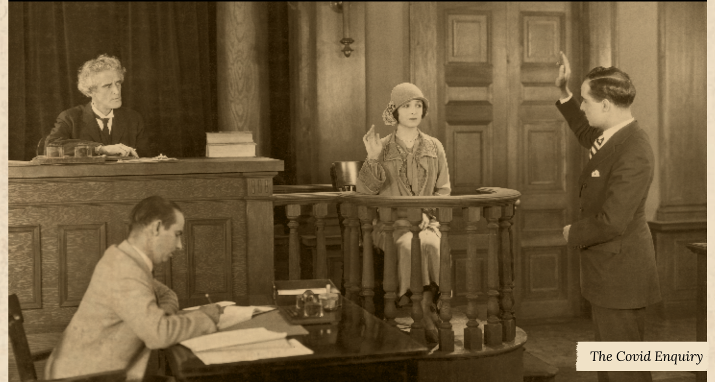
The Covid Enquiry

Speaking ahead of the televised Covid Enquiry, The Covid-19 Bereaved Families for Justice Group commented: