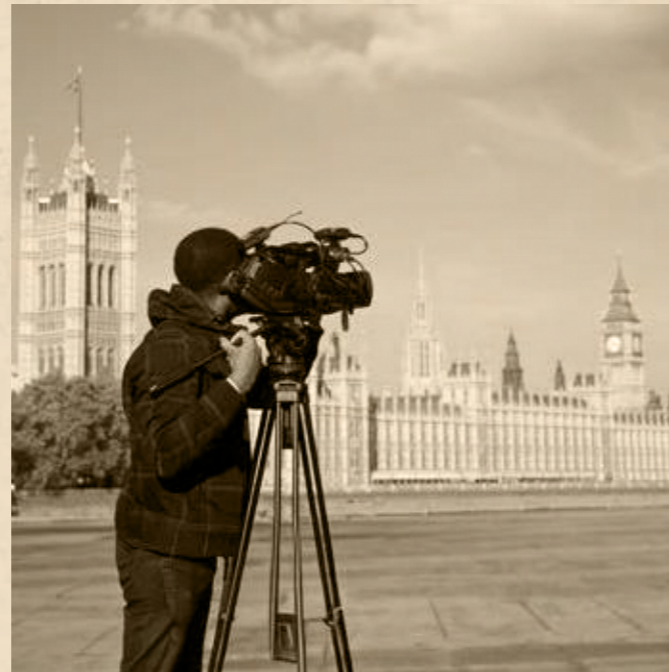
Jeremy Bowen on the Front Line in Ukraine

Jerney Bowen, Kate Adie and Clive Myrie also came under fire from several demented pensioners for wearing flak helmets too often, and not being anywhere near where they were reporting on.