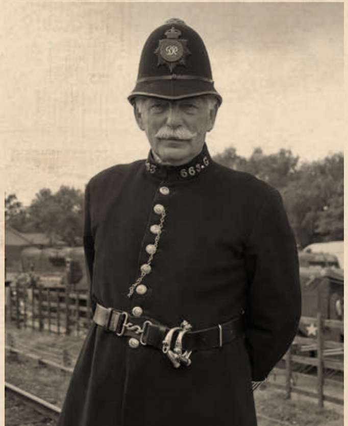
Slipper of the Yard